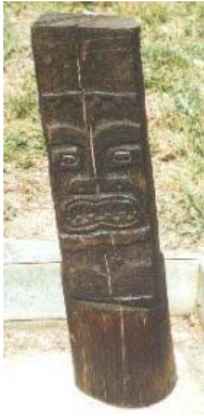
My Entry Way Tiki

A tremendous idea if you have the chance to hold a party on the beach is a pig roast or simply a bring your own meat barbeque over the open fire. The 62 nd Street Longboarders hold an evening end of summer beach barbeque that has become very successful.