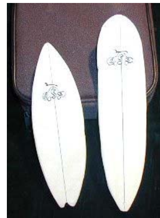
ASC Sacrificial Boards