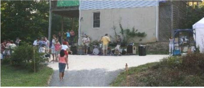
My Artificial Beach Driveway Just Up From My Shop

Another thing those at my luaus like doing is a Hawaiian costume and a south sea dish contest. To get takers, you seriously need to offer something worthwhile as a prize. We've been giving model surfboards, small surfer models, ukuleles, and Puka or shell necklaces as prizes the past few years. In our case, the