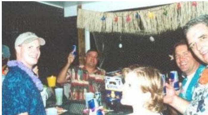
Bar With Deck Lights and Decorations

with a south sea flavor. Netting is also inexpensive and can be draped on the wall next to or behind the bar for added flavor. Some other items on, under, or around the bar that look great are: a small rock filled waterfall that gurgles and trickles down a stair, surf oriented toy figures, fish figures or shells hanging from the netting, shell ashtrays, a surfing poster or two on the wall, a live palm tree, and a blender if you have room. We have a blender with a spout that we use for