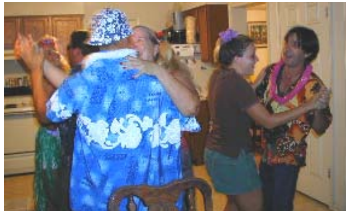
Dancing is Big if You Have Room

Even if you can get a band, it's fun if you can find someone to solo jam during the party or when the band takes a break. We have several surfers like that locally, one that plays a mean 12-string, one that both plays and composes, and one that plays and sings lead in a Beach Boys type surf band. When we do have a band, they like to sing and play for fun when the band breaks, and also sometimes go on well after the band is through for the evening. I've found that the band members really enjoy this and have started bringing their wives to the party just to have a good time. One year the composer really got into the party and actually came up with a song, complete with music, that included naming everyone who showed up, plus many who didn't. We filmed the production and it has become a real icon I sometimes pull out and play on the TV during more recent luaus.