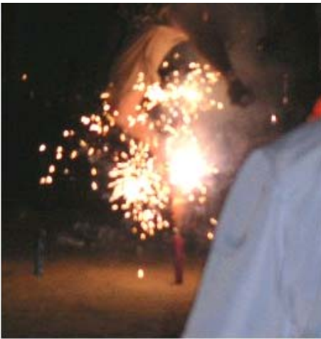
After Sacrifice Fireworks are Fun

get aggressive and those with costumes will suffer.