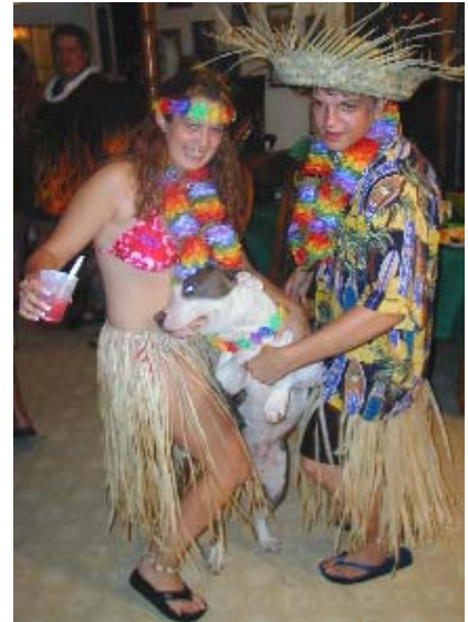
Even Pets Can Have Fun

of years ago that showed me a better way of doing things. Previous board sacrifices had used either real boards or cardboard cutouts. Instead of a real board, make a couple of small boards out of surfboard foam. Also, don't discriminate between longboard and short; make two. I think someday I'm going to come up with a model kneeboard (or kneeboarder) to sacrifice. The boards shouldn't be longer than 6 to 8 inches each with a small glued on fin. This size can be burned in a small fireplace, patio burner, or any other controlled burning area. Also, if you have time, paint or hand-draw a design on your boards.