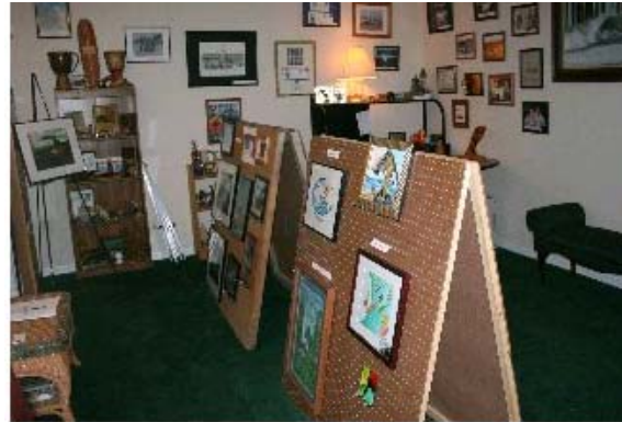
Indoor Art Show

While regular parties are usually focused on the most current tunes available, I suggest