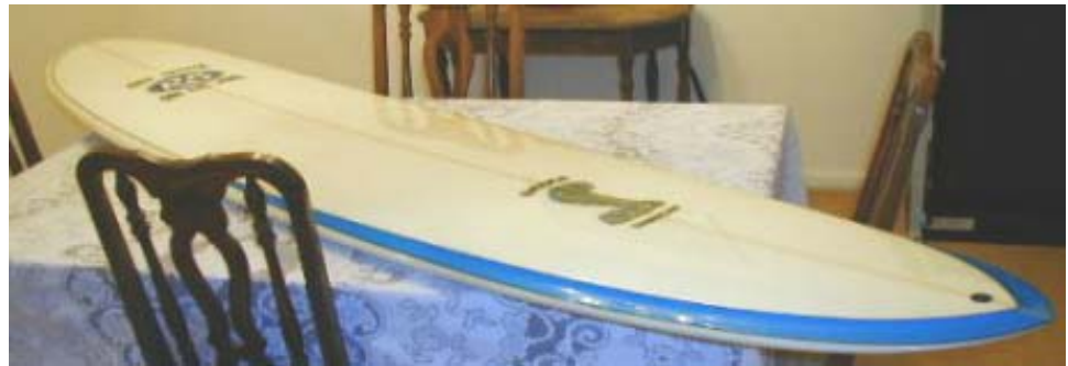
New Snake Board on Display at a Luau

For the past few years we've had a very small exhibit of some new boards to show off. One year, local distributor (and band guru) George Vermillion brought a few Nezzzy Surfboards to show those attending.