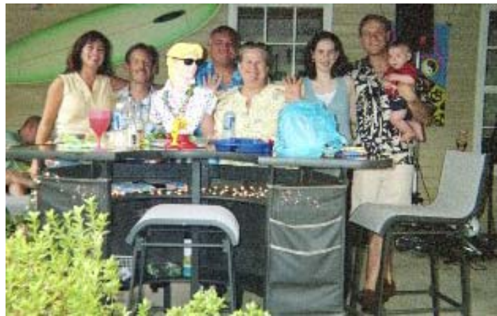
Key West Party Goes Around an Interesting Centerpiece Used as the Costume Winner Award

It's a little hard for traditional dancing to a band if you have a small house, but maybe you can get a smaller band with a drummer that has a small size drum set for such