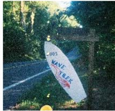
The Shop Sign at the Driveway Was Easy to Spot

Authors Note: The majority, but not all of pictures herein were taken at local surf club parties, luaus or at my home during my annual luau.